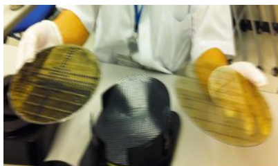
Ultra thin Si wafer