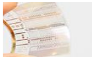
Flexible organic device